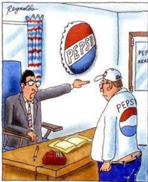
"You're fired, Jack. The lab results just came back, and you tested positive for Coke."