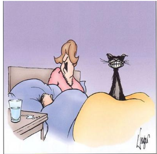
"Wake up. The cat's got your teeth."